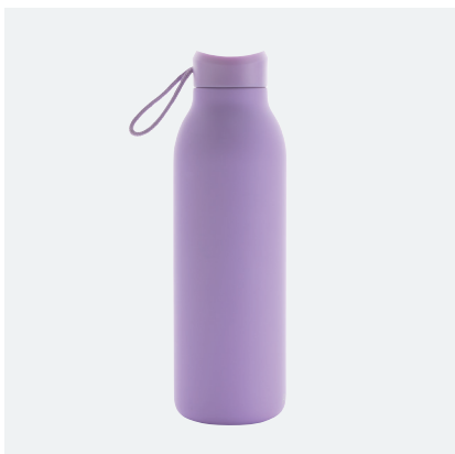
Avira Avior RCS Re-steel bottle 500 ML