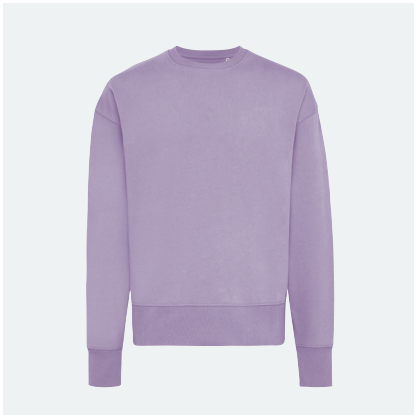
Iqoniq Kruger relaxed recycled cotton crew neck