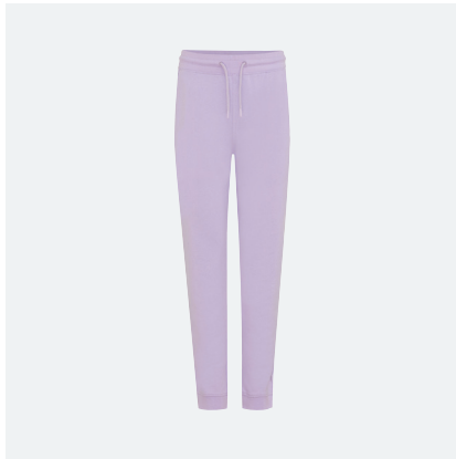
Iqoniq Cooper recycled cotton jogger