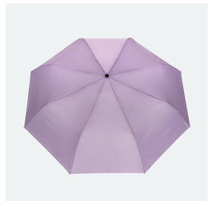
21" Impact AWARE™ 190T mini auto open umbrella