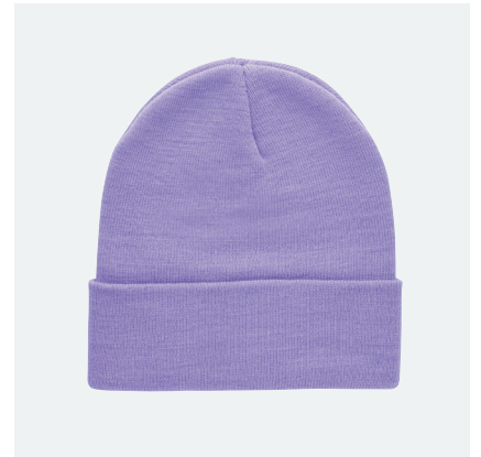
Impact AWARE™ Polylana® beanie