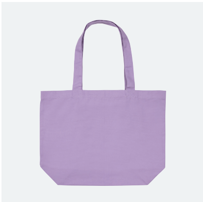
Impact AWARE™ 240 gsm rcanvas shopper w/pocket